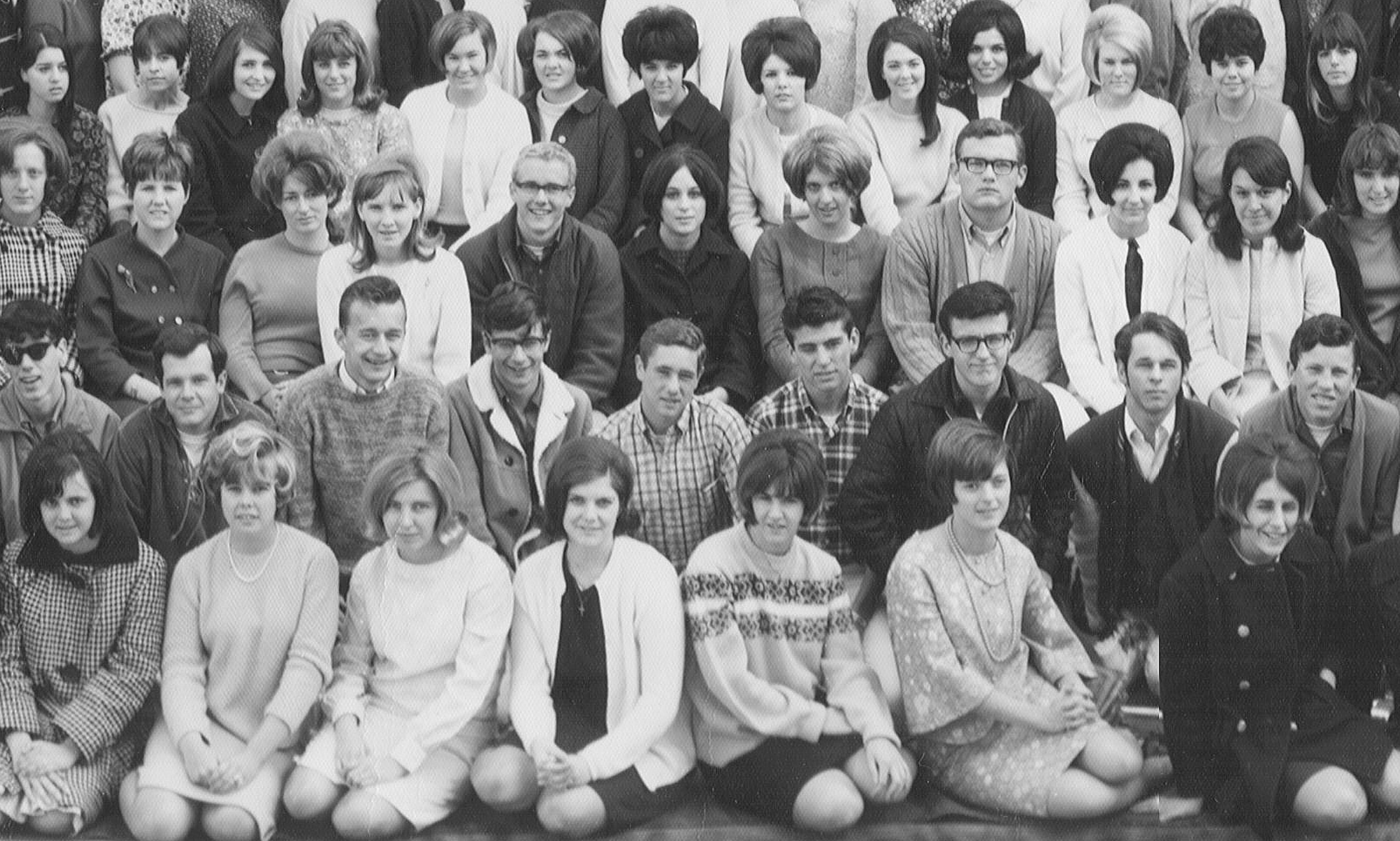
CLAYTON VALLEY HIGH SCHOOL - CLASS OF 1967